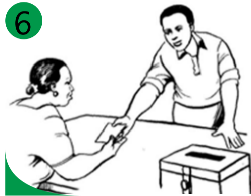
6 Mokhethi o fana ka lipampiri ho mokhethisi hore a li tlose likutu