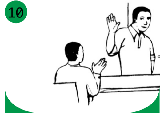
10 U qetile 'me u ka tsamaea ka khotso

Sheba lebitso la hao le motse oa heno ho www.iec.org.ls u tsebe ho tseba moo u khethelang teng