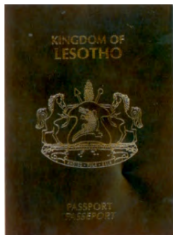
BUKANA EA HO ETA (PASSPORT)