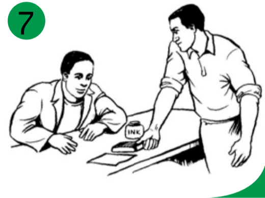
7 Monoana oa hao o tlotsoa ka enke