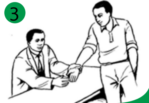
3 Menoana ea hao e hlahlojoa Enke