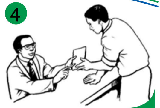
4 U fua lipampiri tse peli, ea ho khetha moiketi le ea ho khetha mokha oo u o ratang