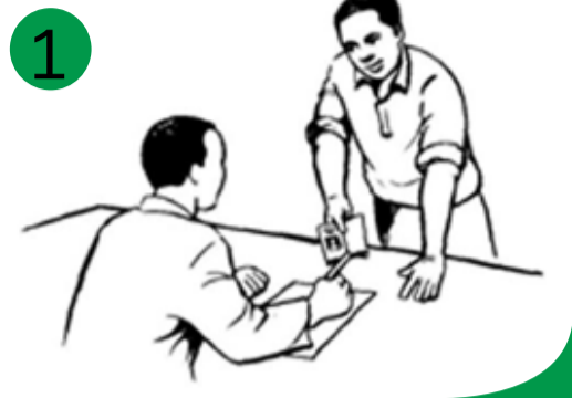
1 U hlahisa boitsebiso ba hao