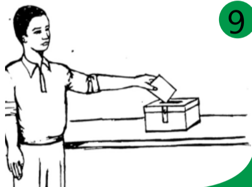
9 U akhela pampiri ea ho khetha mokha ka lebokoseng