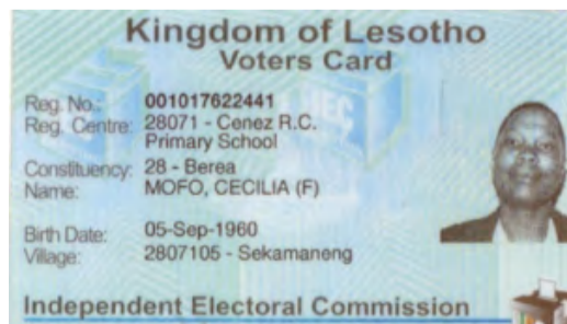
KARETE EA HO KHETHA (VOTER REGISTRATION CARD)