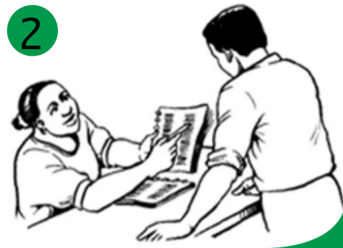
2 Lebitso la hao le hlahlojoa lenaneng la bakhethi