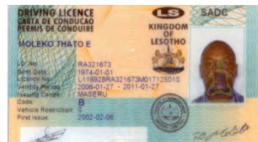
LENGOLO LA HO QHOBA (DRIVER'S LICENCE)